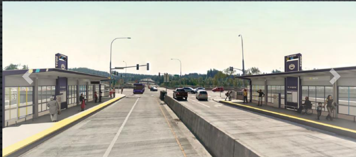
Rendering of Stride station on I-405

I-405 Bus Rapid Transit Online Open House Open Until February 14th ( https://i405brt.participate.online/ )